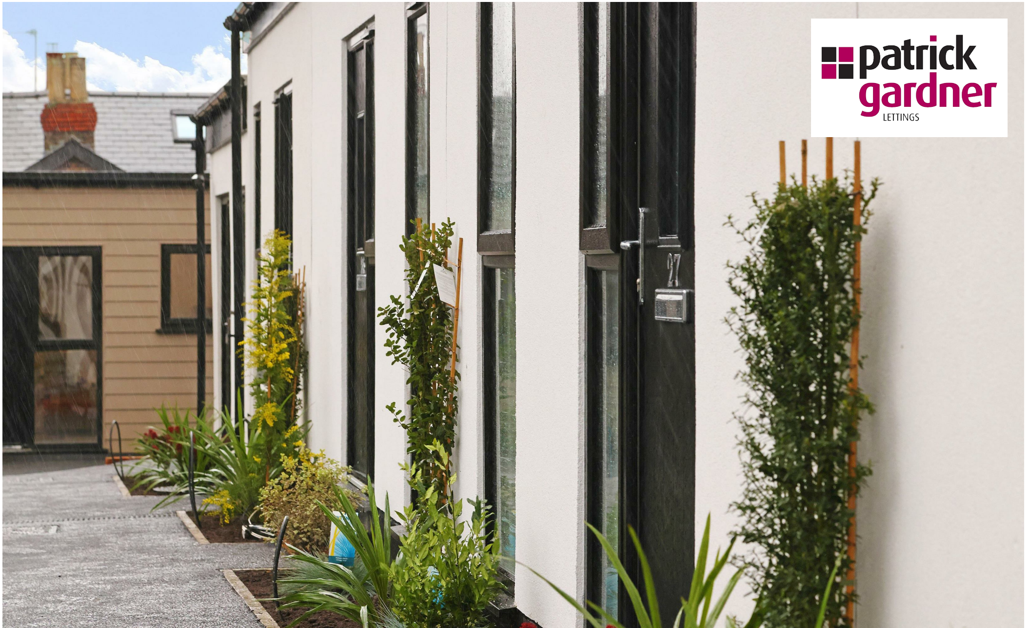
Vincent Walk, Dorking, RH4 3JB